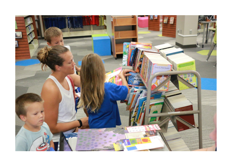
Kids picking out book prizes during the summer reading program.

For more information, check the event schedule on the librarys website www.MHKLibrary. org or pick up a brochure at one of the library's service desk.